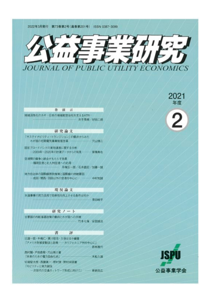
(Source: Journal of Public Utility Economics Site, https://www.jspu-koeki.jp/gakkaisi/magazine.html )

Also, the Society has an award system, under which it annually grants Academic Awards and Incentive Awards to excellent books written by relatively young members.